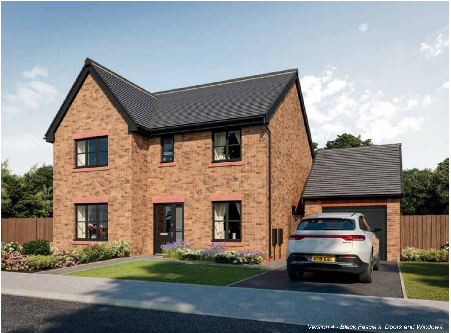
Version 4 - Black Fascia's, Doors and Windows.