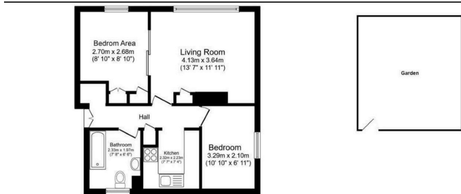
Total floor area 47.5 sq.m. (511 sq.ft.) approx