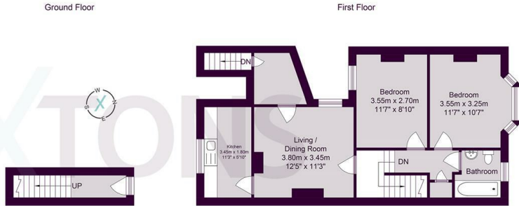
Approximate gross Internal floor Area 59.66 sq m / 642.17 sq ft

Whilst every care has been taken to ensure accuracy, dimensions are approximate and for illustrative purposes only.