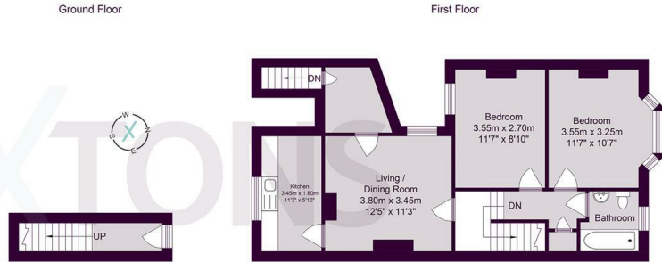
Approximate gross Internal floor Area 59.66 sq m / 642.17 sq ft

Whilst every care has been taken to ensure accuracy, dimensions are approximate and for illustrative purposes only.