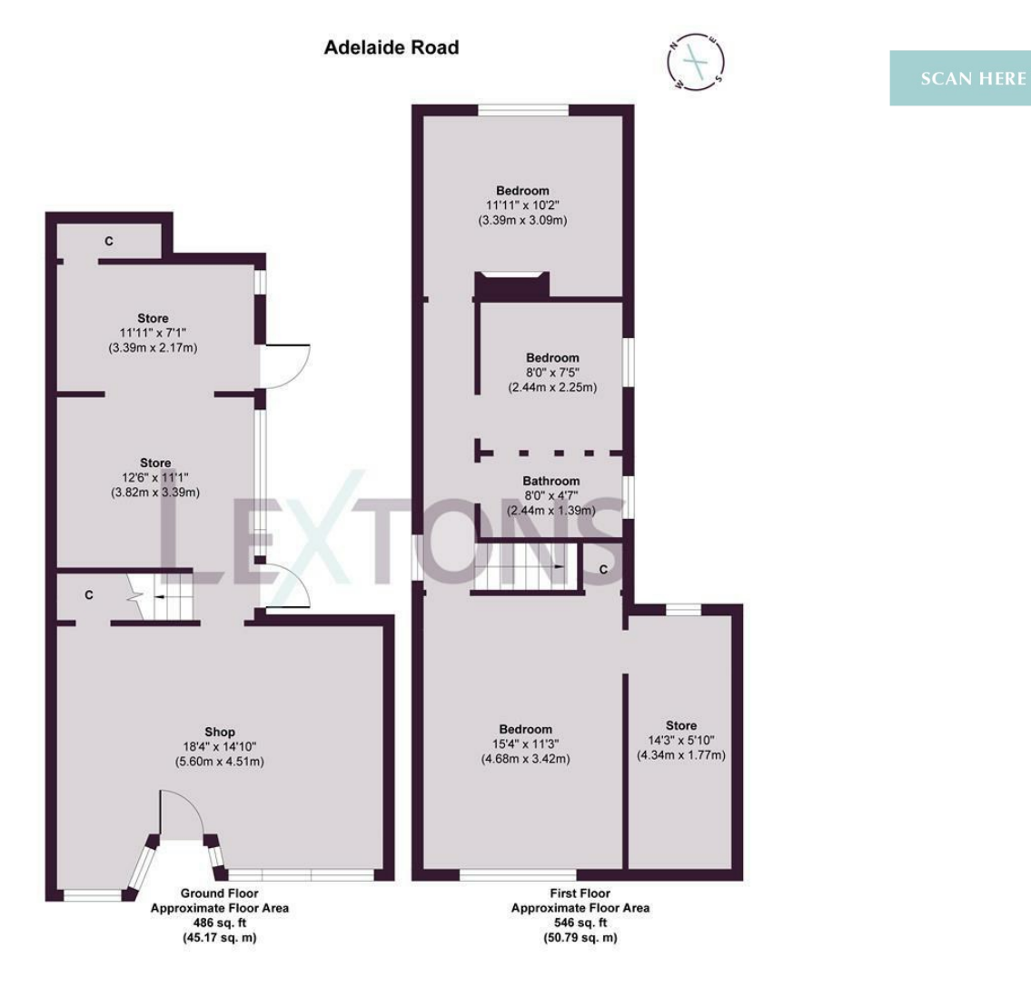
Approx. Gross Internal Floor Area 1032 sq. ft / 95.96 sq. m