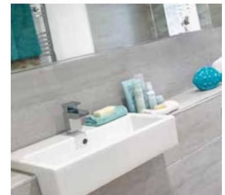
Room with a view With tiles from Porcelanosa, you'll never want to leave the bathroom - no excuses for looking less than gorgeous then!