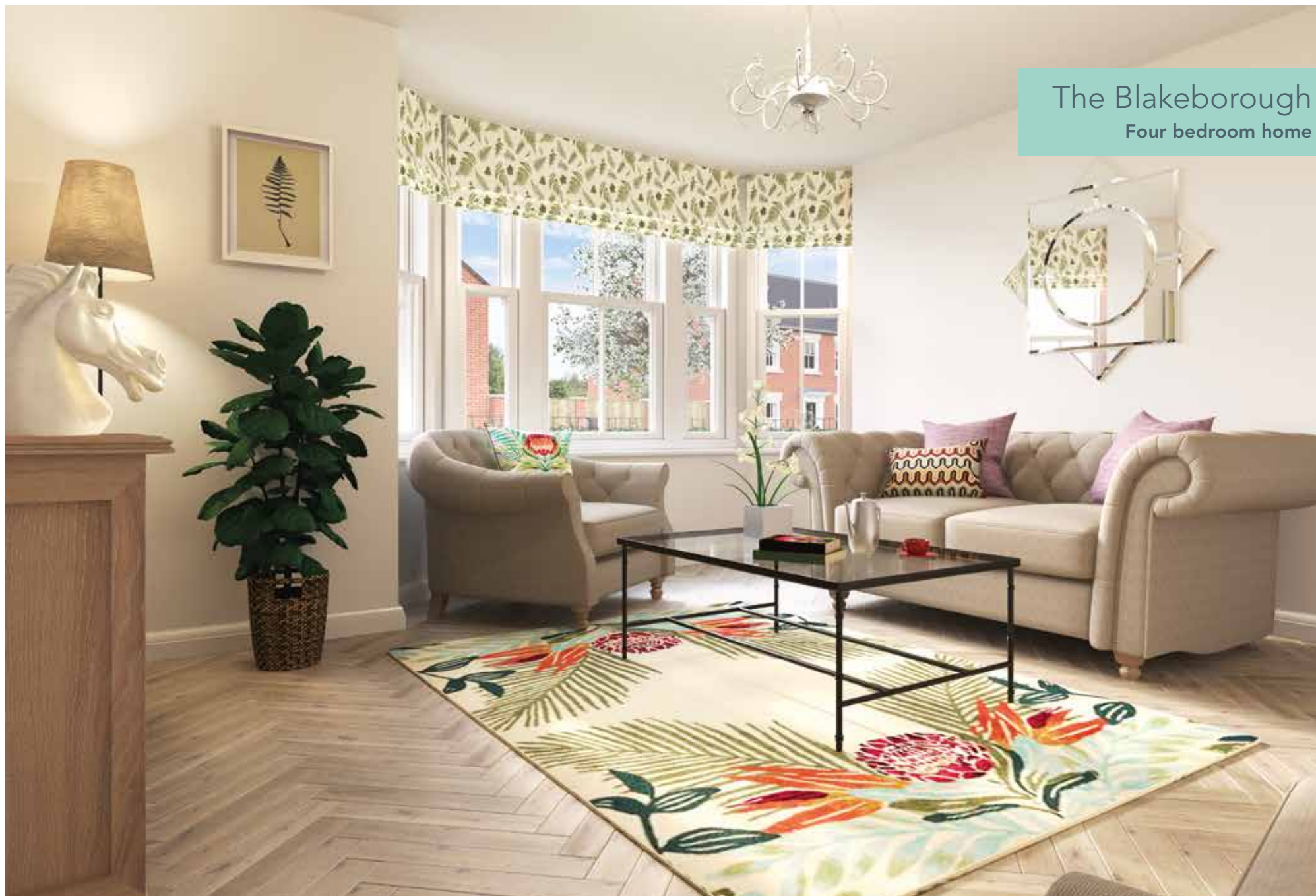
The Blakeborough Four bedroom home