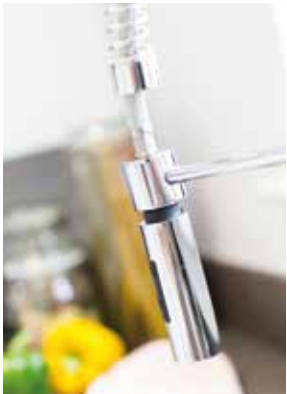
High spec fitted kitchen Fitted units in a choice of traditional or modern styles and a choice of complementary worktops and handles. You'll love your fully integrated kitchen.