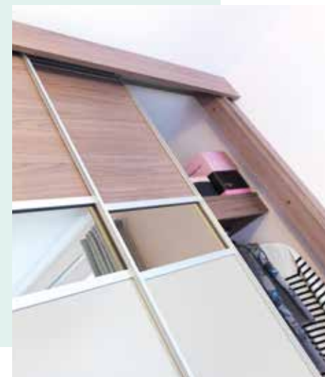
Everything in its place Why not add space saving wardrobes to your bedroom? Leaving plenty of room to spread out.