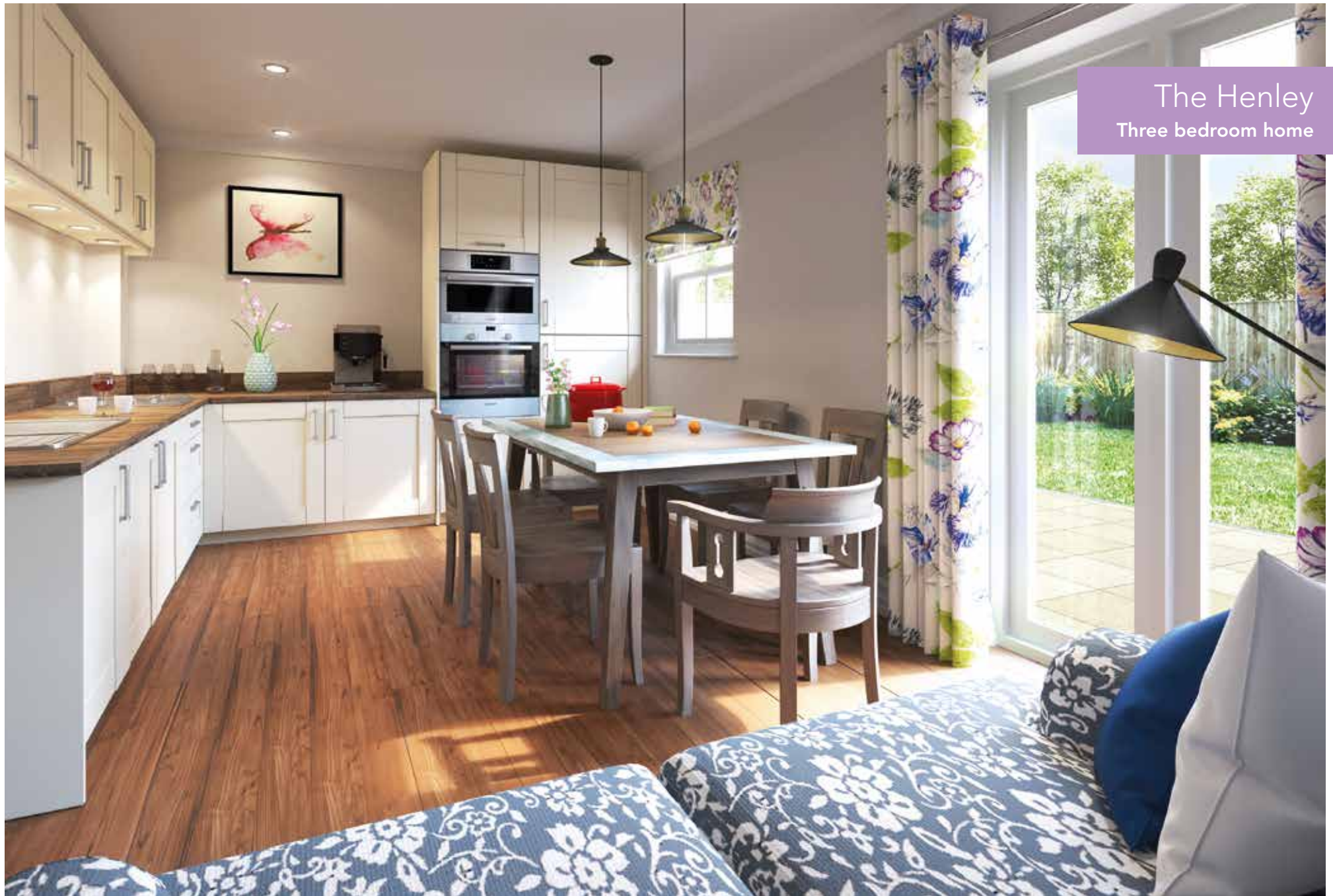
The Henley Three bedroom home