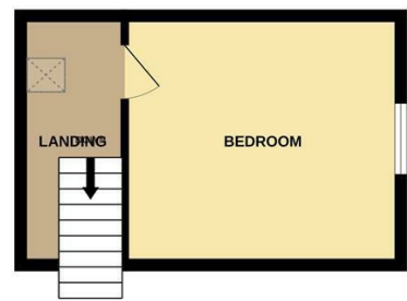
1ST FLOOR 206 sq.ft. (19.1 sq.m.) approx.