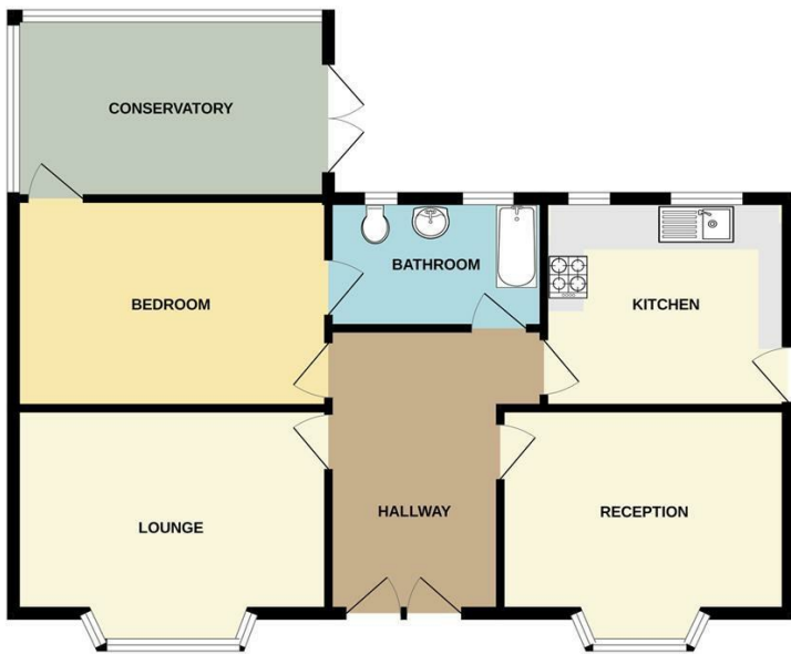
GROUND FLOOR 816 sq.ft. (75.8 sq.m.) approx.