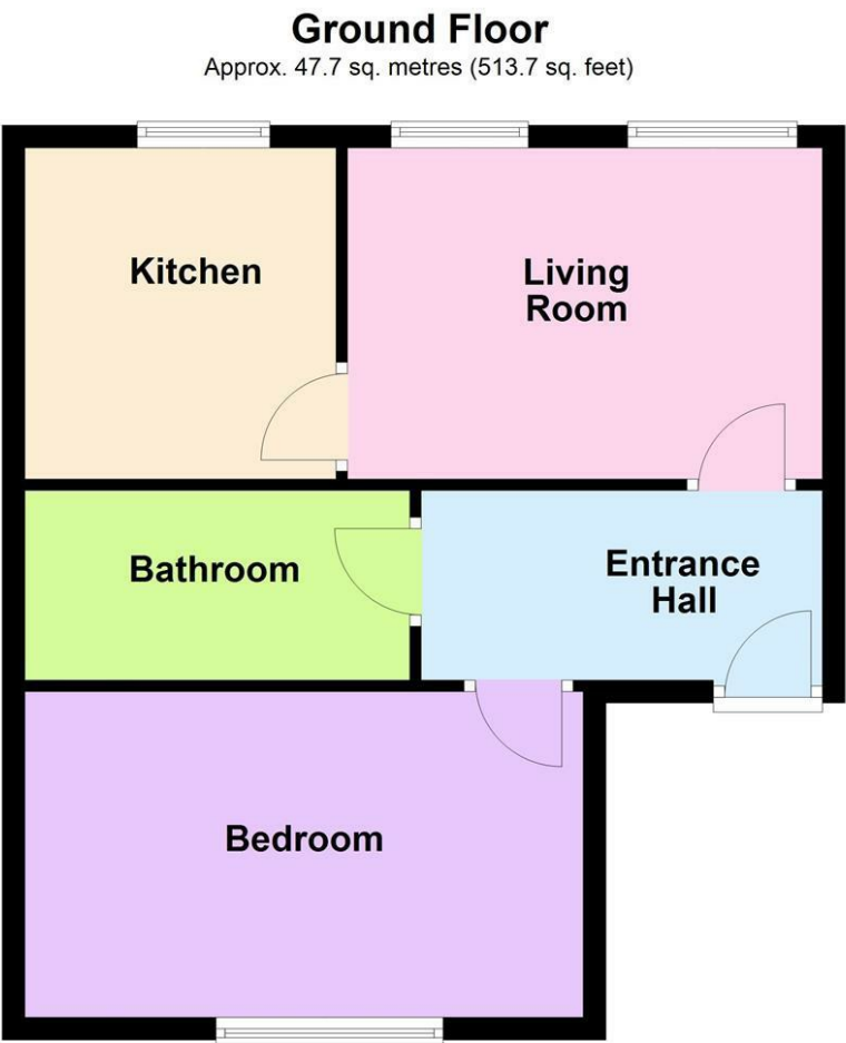
Total area: approx. 47.7 sq. metres (513.7 sq. feet)

These particulars, whilst believed to be accurate are set out as a general outline only for guidance and do not constitute any part of an offer or contract. Intending purchasers should not rely on them as statements of representation of fact, but must satisfy themselves by inspection or otherwise as to their accuracy. No person in this firms employment has the authority to make or give any representation or warranty in respect of the property.