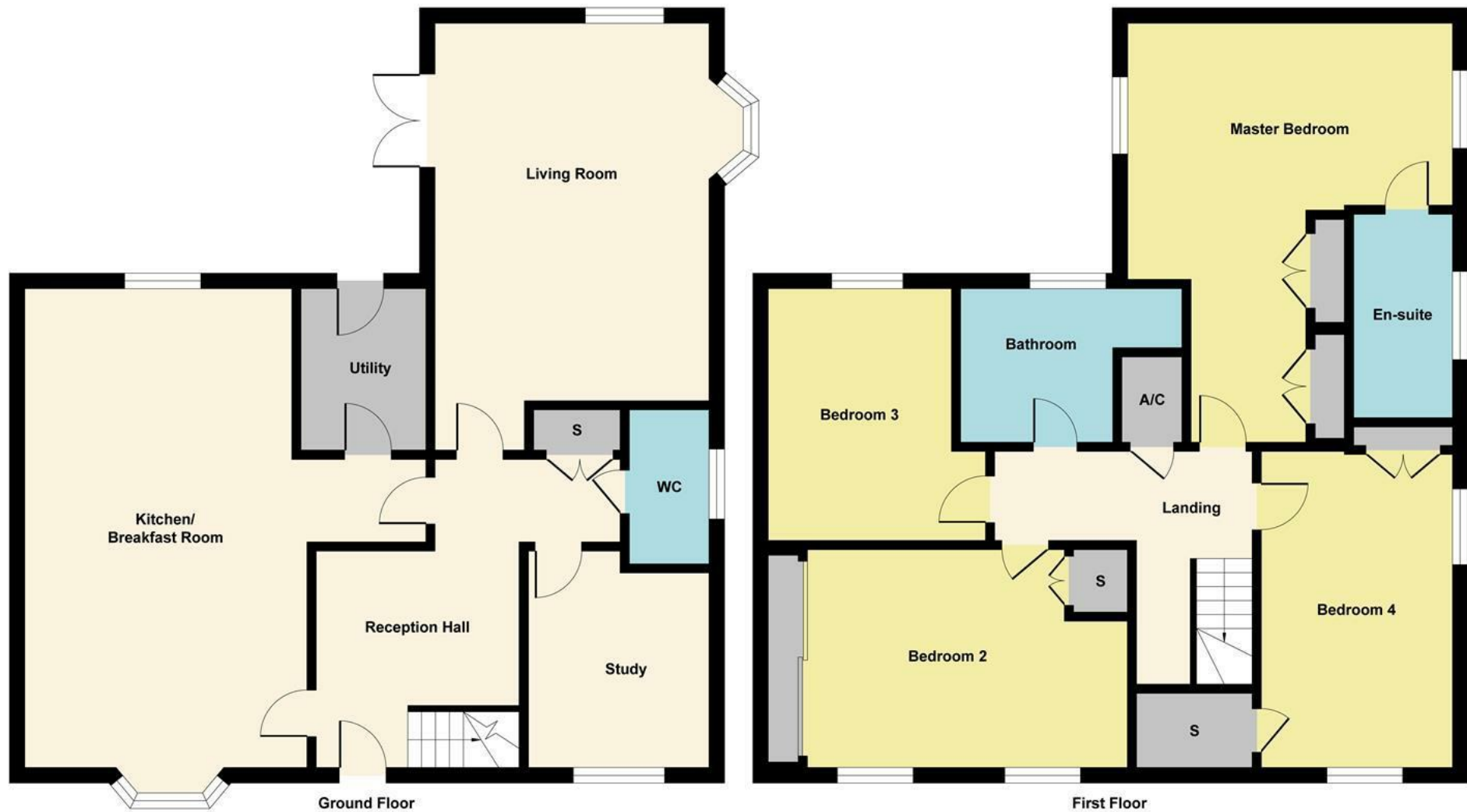
Illustration for identification purposes only, measurements are approximate, not to scale. Produced by Elements Property