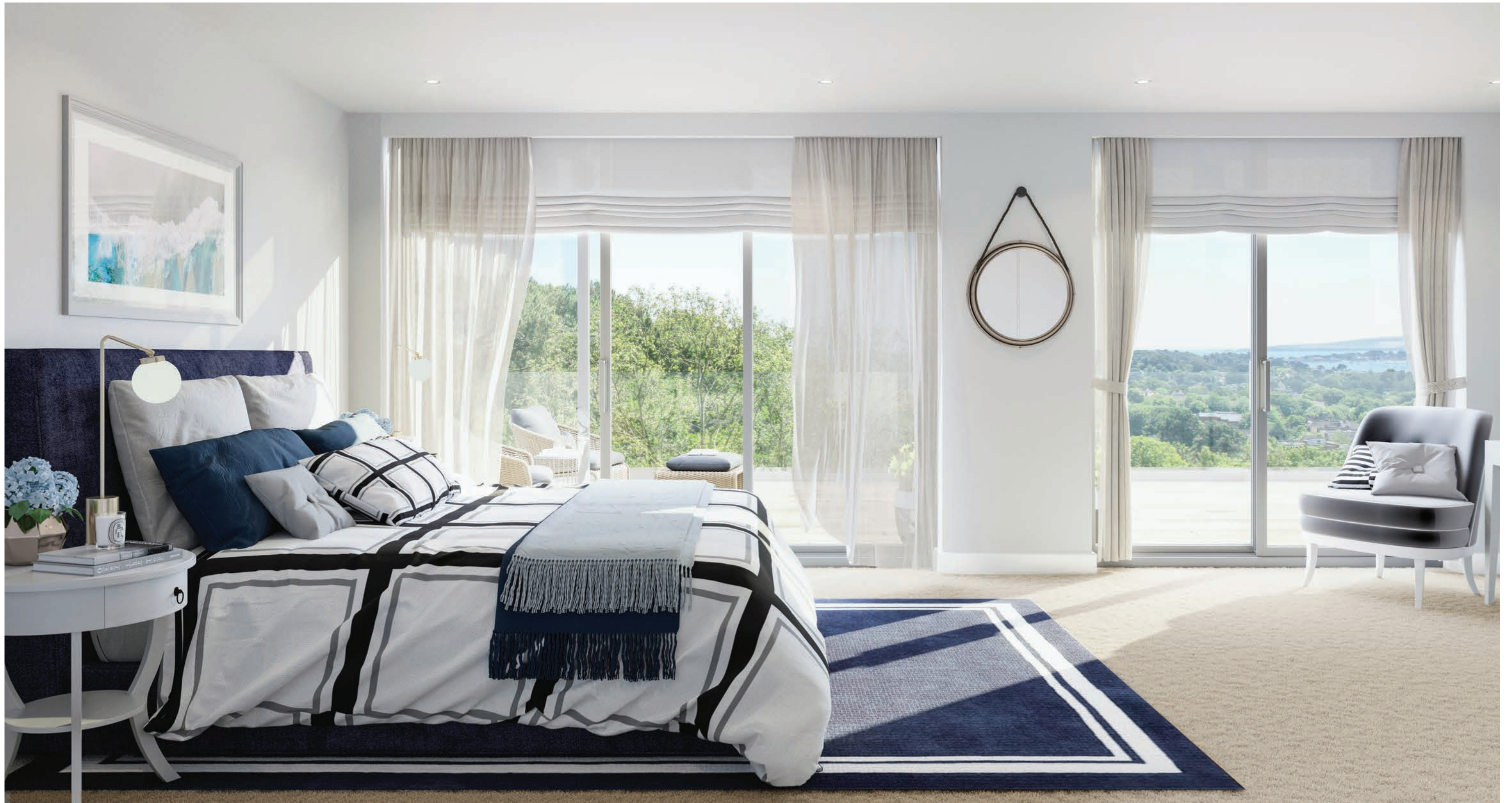
Computer Generated Image - Typical bedroom layout.