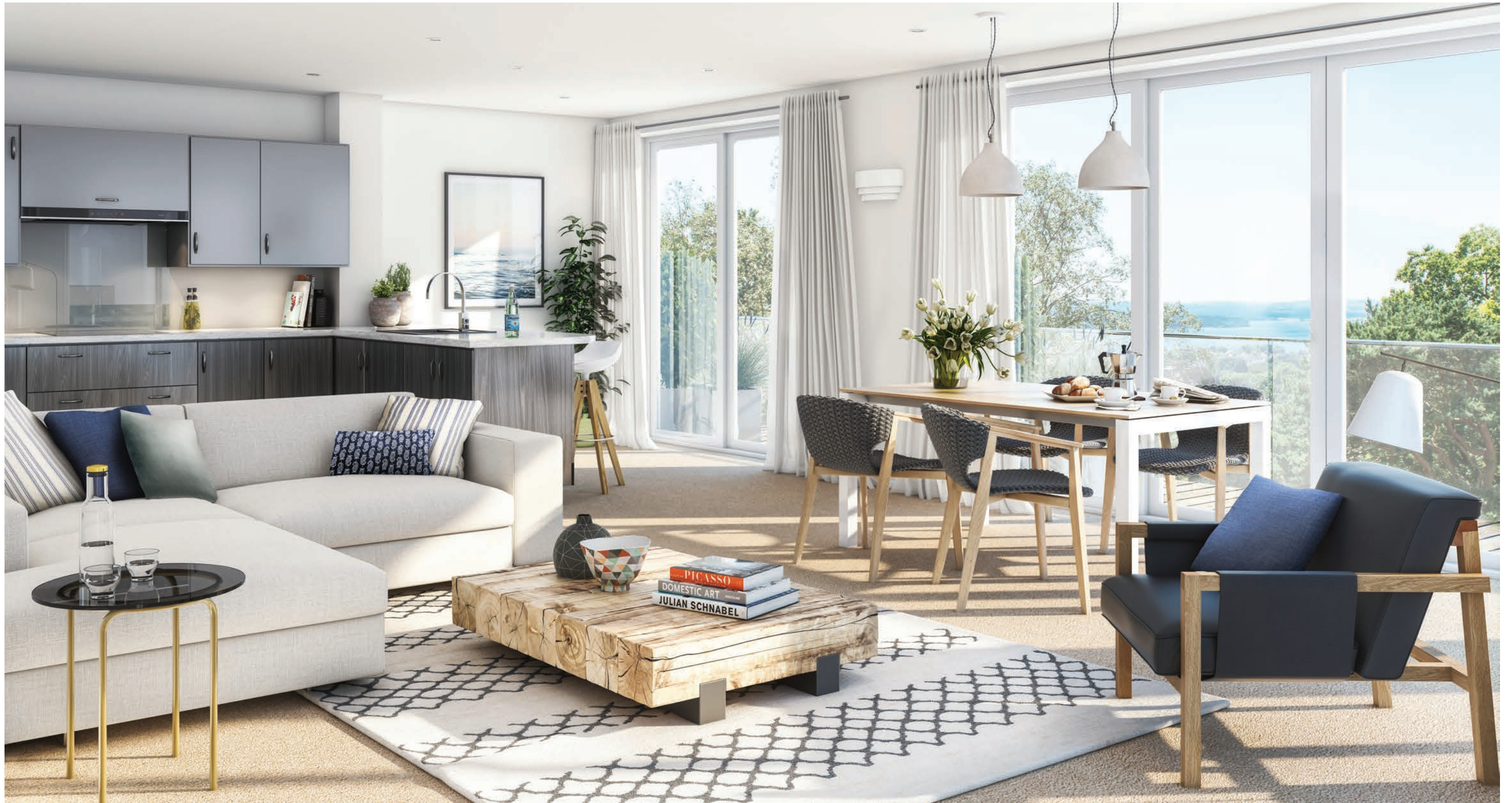
Computer Generated Image - Typical open plan apartment layout.