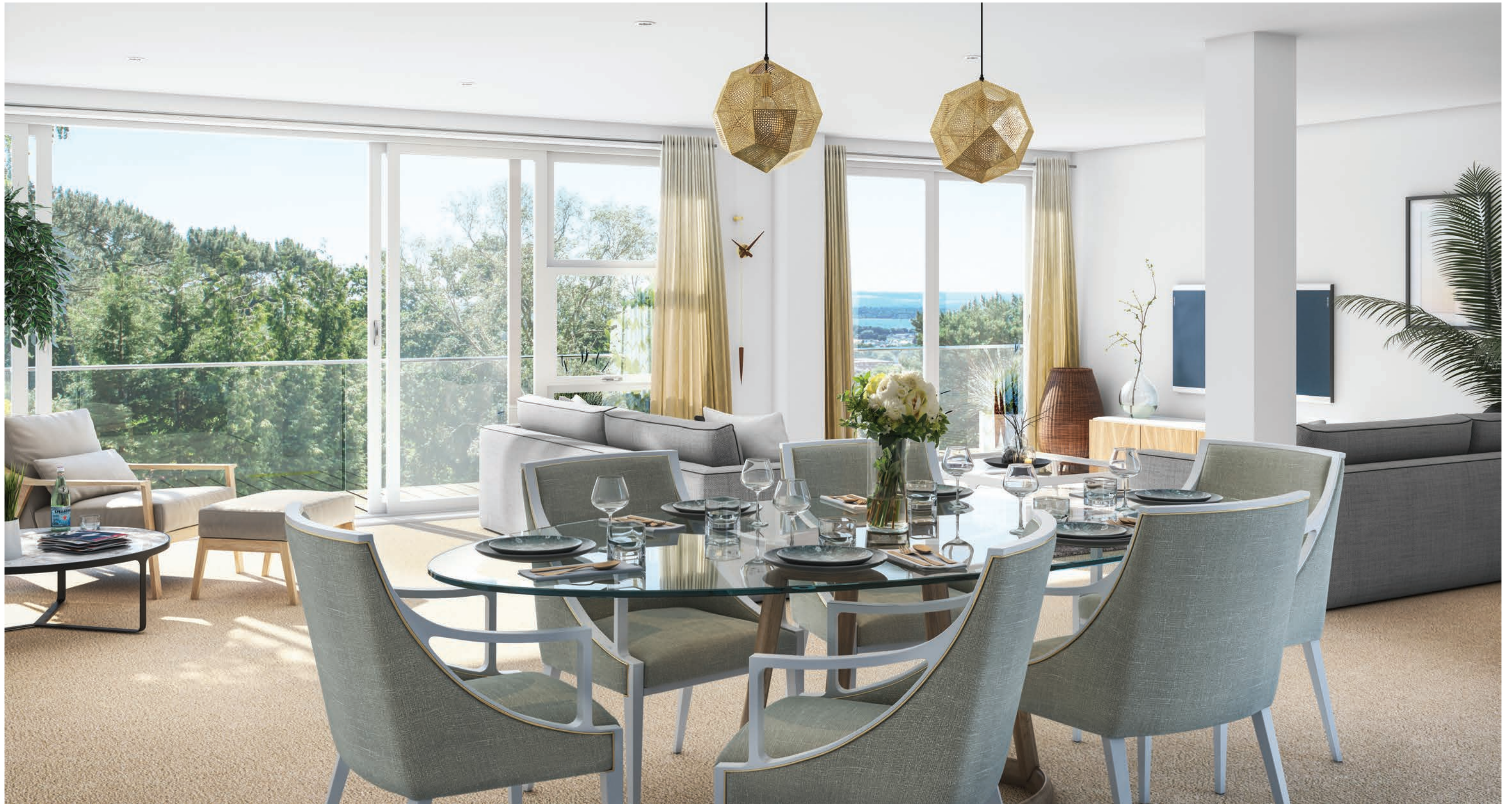
Computer Generated Image - Typical open plan apartment layout.