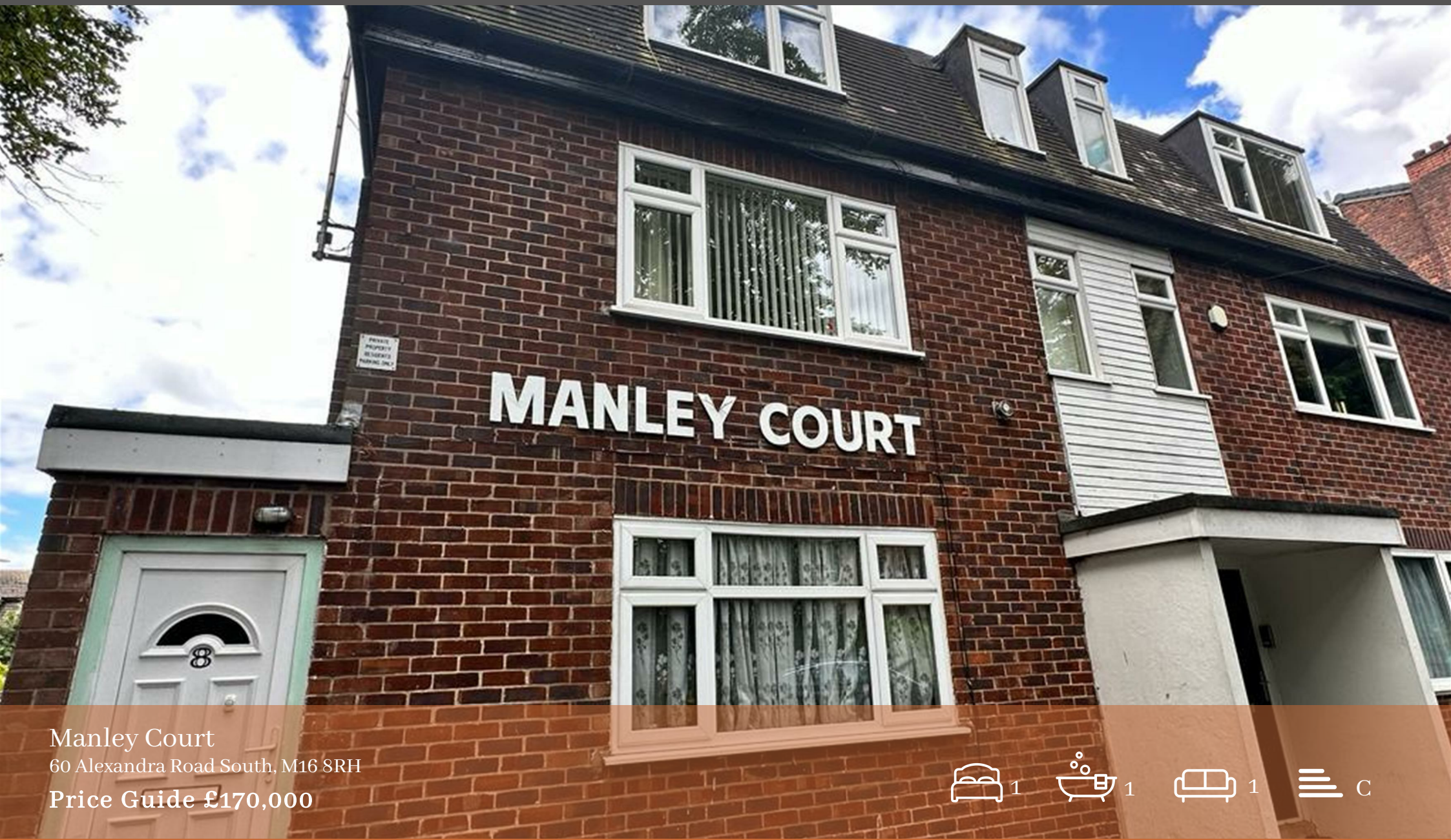
Manley Court 60 Alexandra Road South, M16 8RH Price Guide £170,000