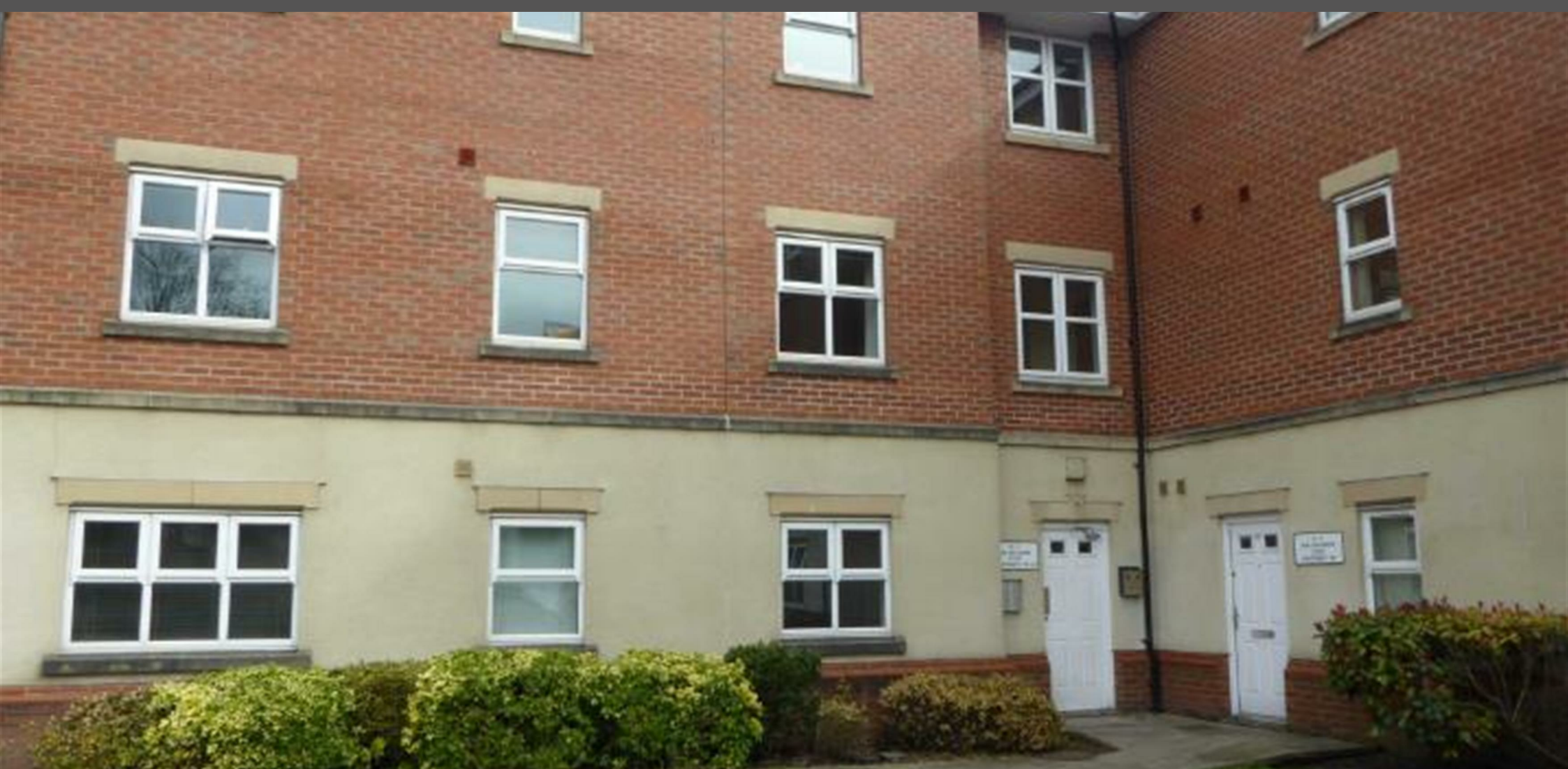
Sydney Court New Belvedere Close, Stretford, M32 0EG £950 PCM