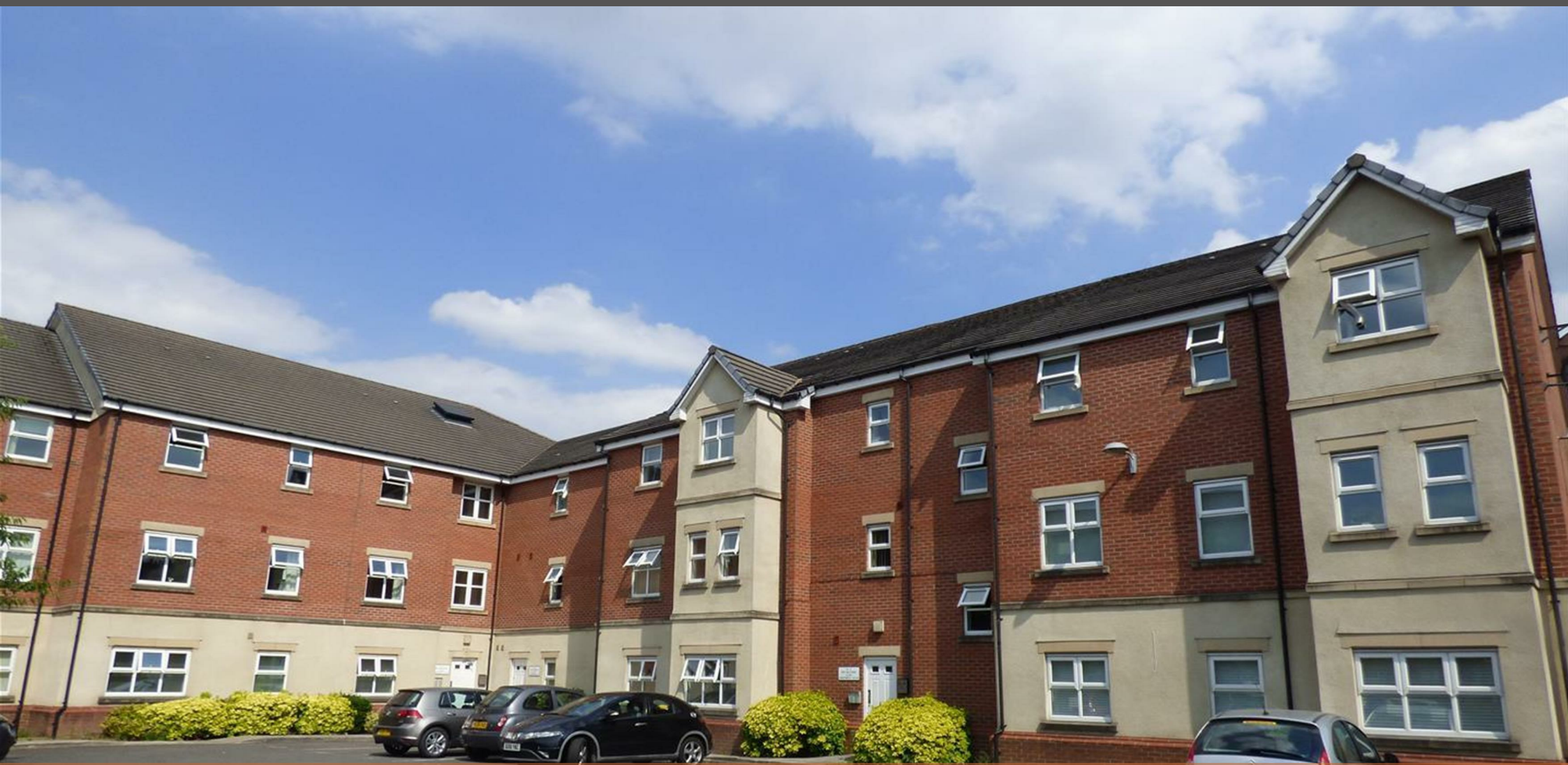
Sydney Court New Belvedere Close, Stretford, M32 0EG £1,100 PCM