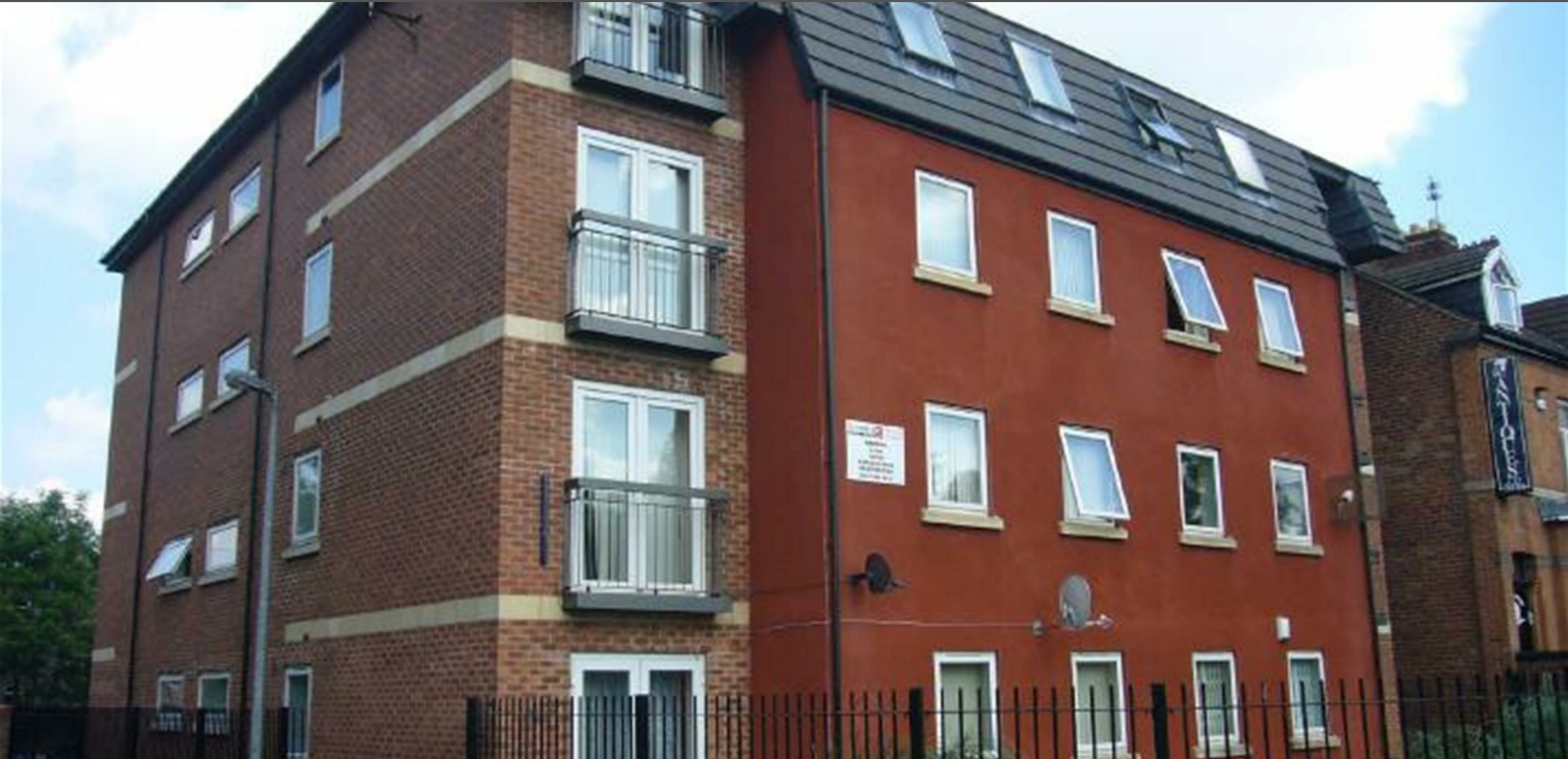
Quince House 2 Milton Place , M6 5RL Price Guide £130,000