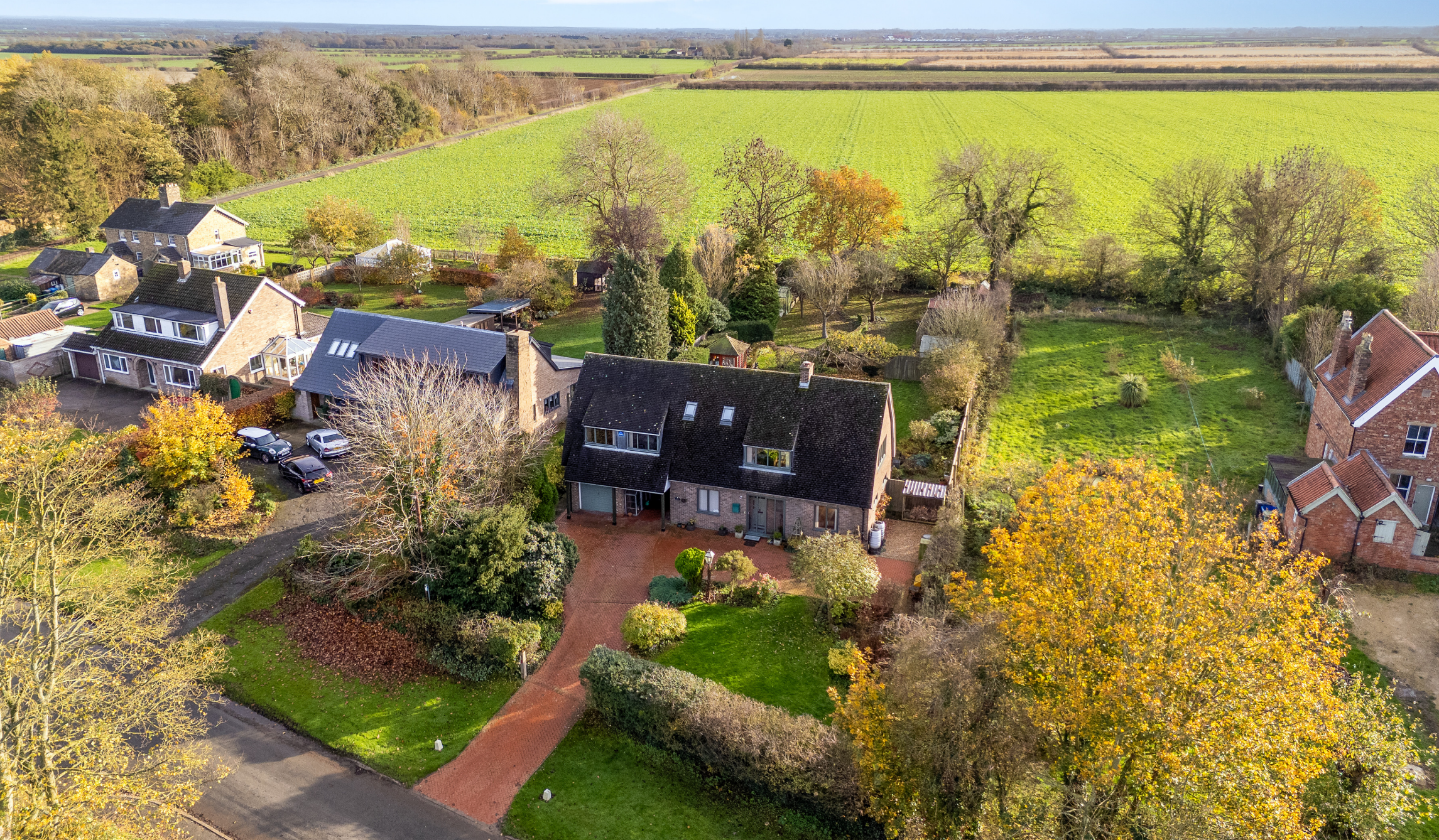
Marygold House Hackthorn, Lincoln