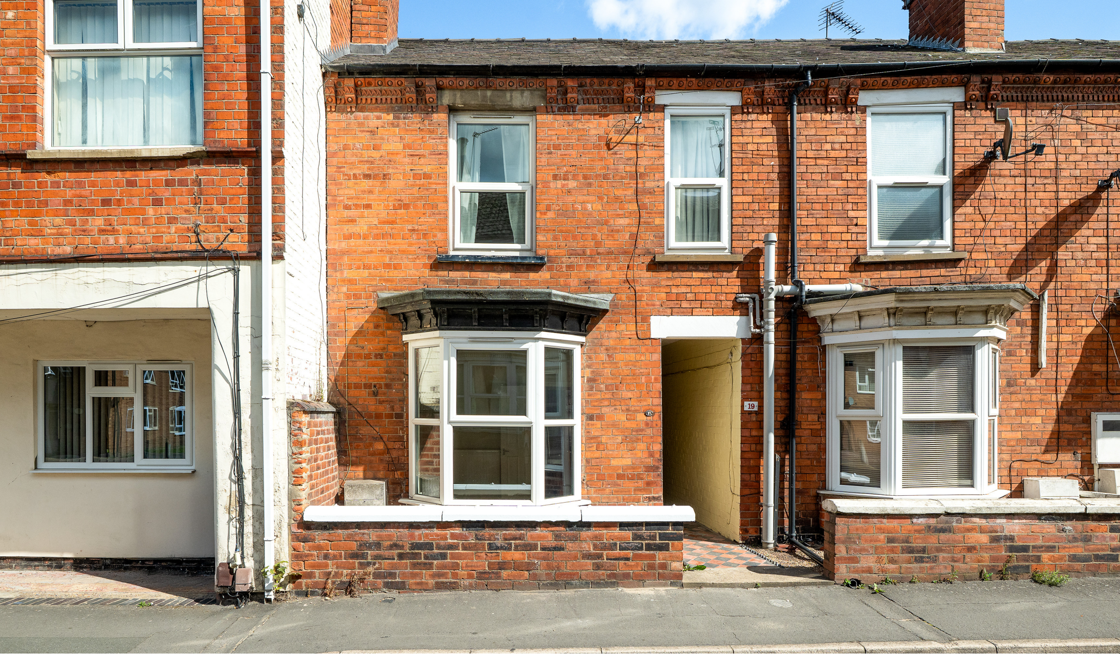
21 Gaunt Street Lincoln