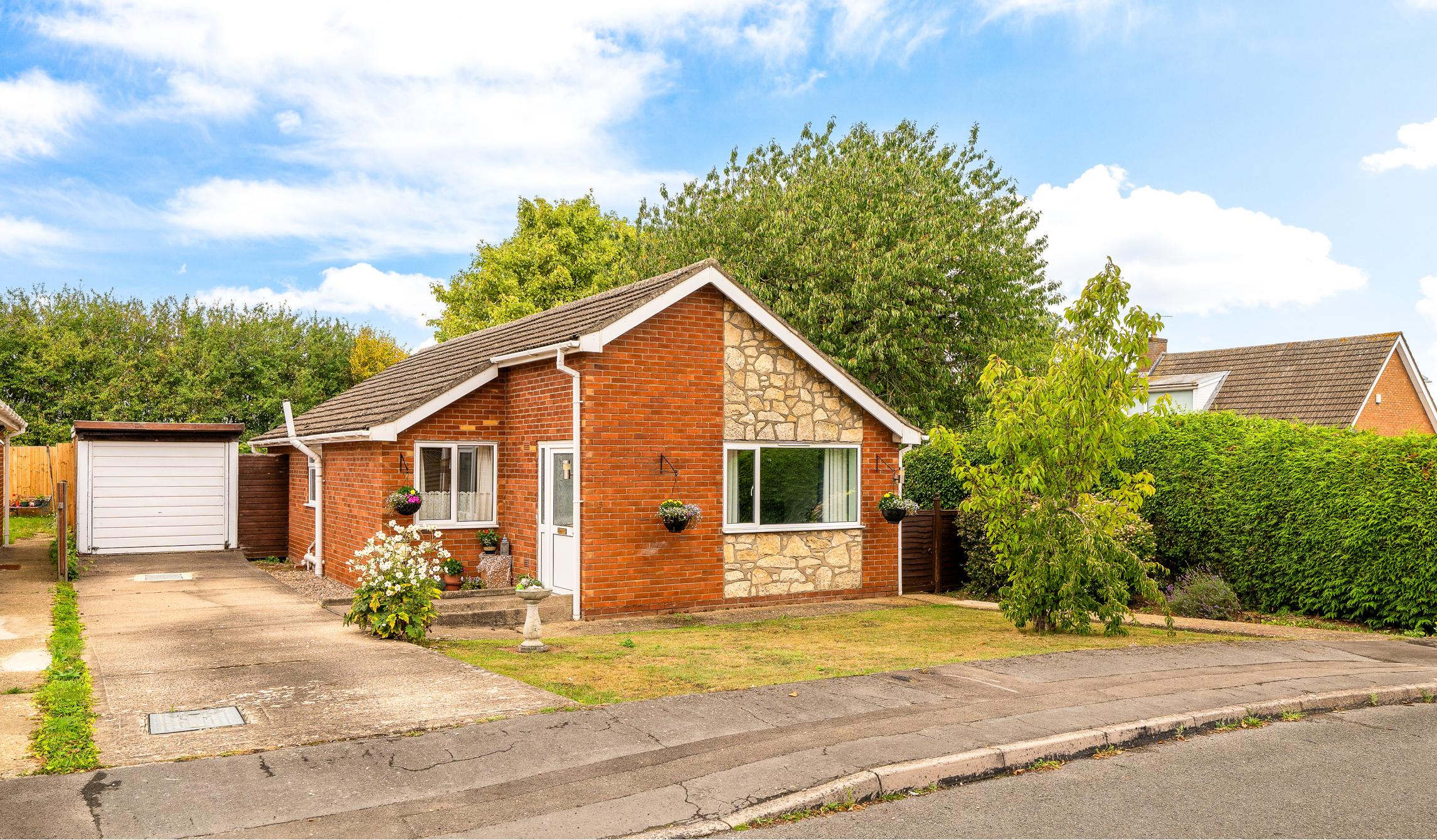
15 Flintham Close Metheringham, Lincoln