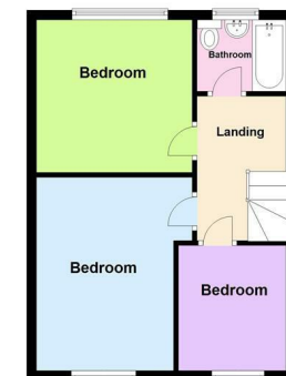
First Floor Approx. 37.7 sq. metres (405.3 sq. feet)

Total area: approx. 96.2 sq. metres (1035.1 sq. feet)