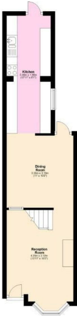
Ground Floor Approx. 34.1 sq. metres (367.3 sq. feet)