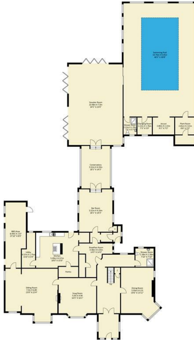
Ground Floor Approximate Floor Area 5334.59 sq. ft (495.60 sq.m)

Approximate Gross Internal Area = 747.90 sq m / 8050.32 sq ft Illustration for identification purposes only, measurements are approximate, not to scale.