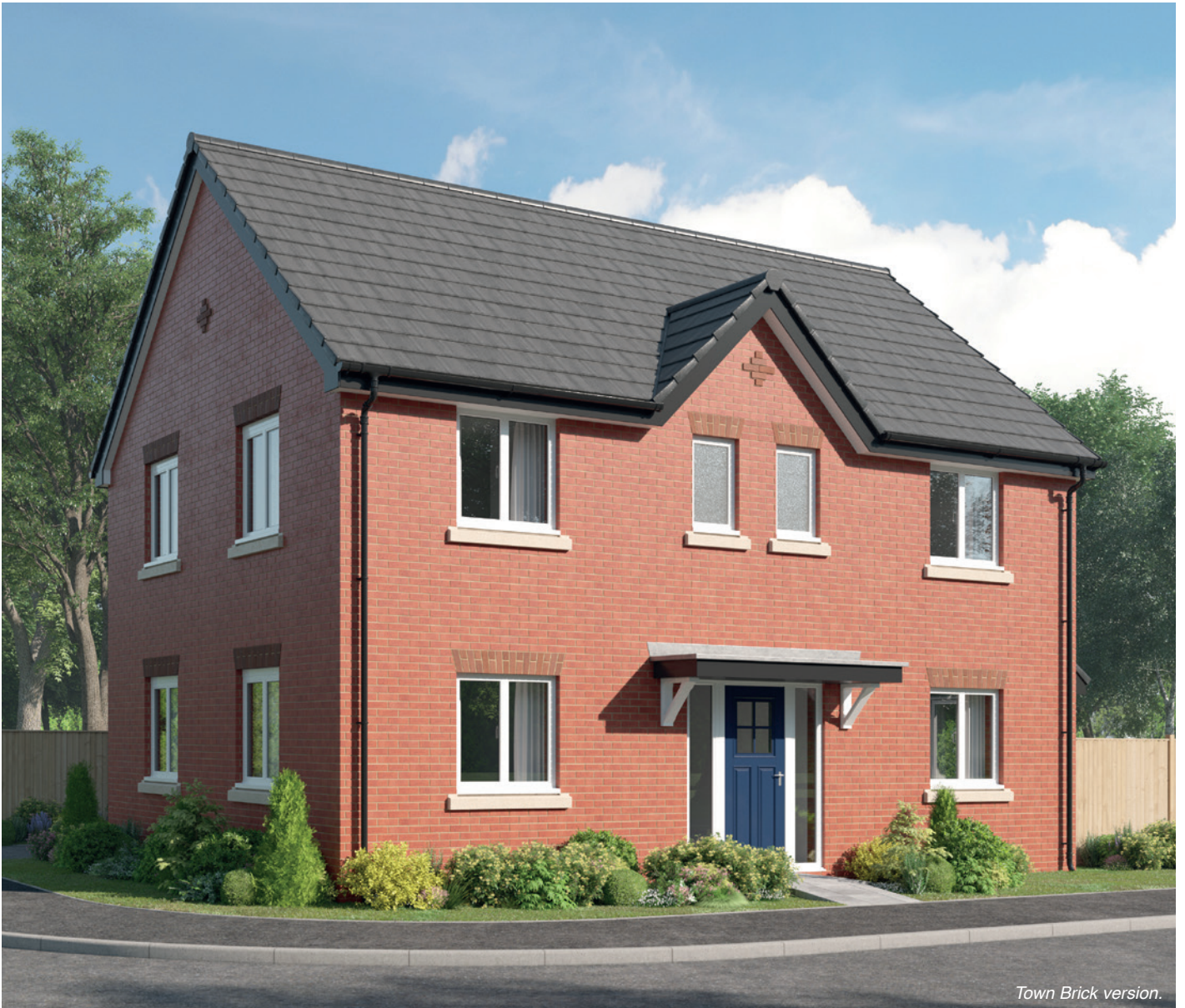
Town Brick version.