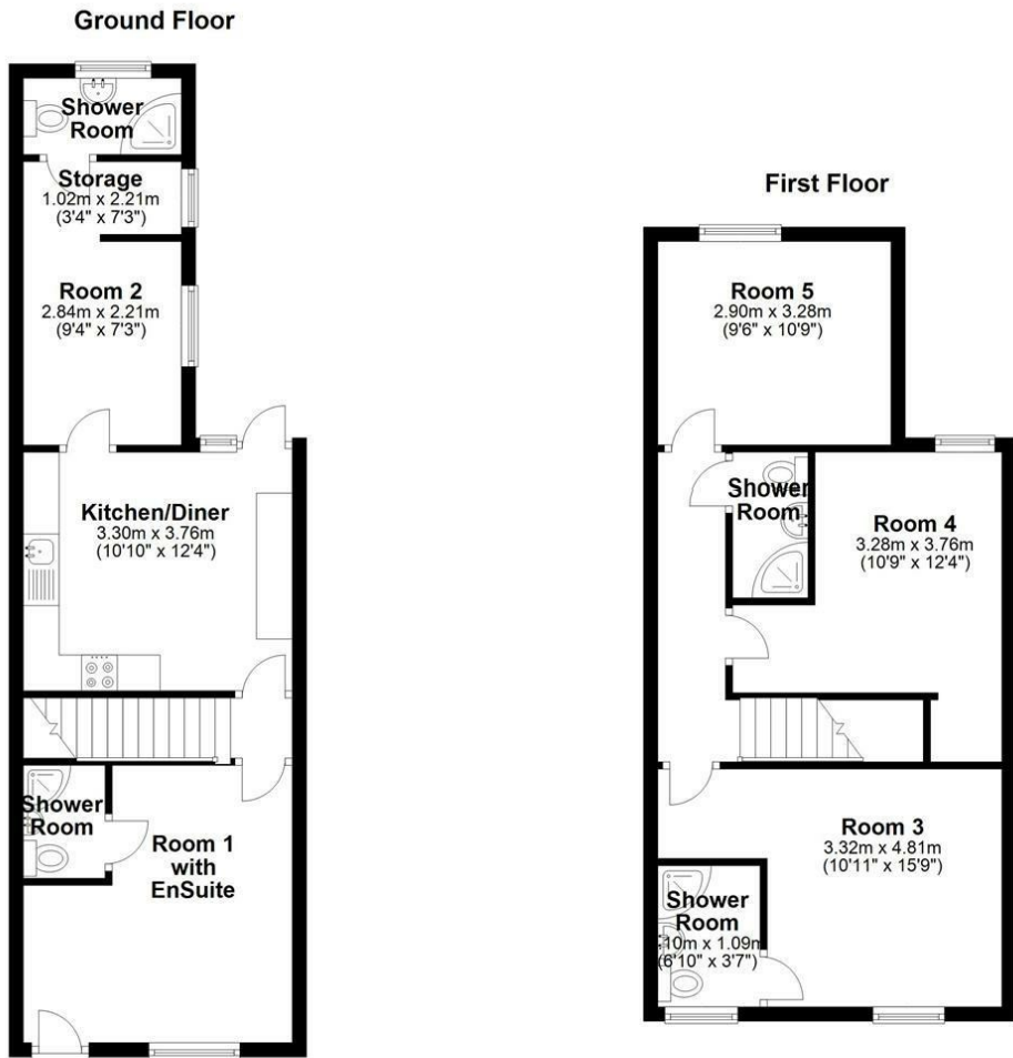
NICHOLAS HUMPHREYS. This Floorplan is for illustrative purposes only and while reasonable efforts have been made to ensure its accuracy, it is not to scale and measurements should not be relied upon. For display and layout purpose only used by NICHOLAS HUMPHREYS, as a general indication of the layout. It does not form any part of any contract or warranty. Plan produced using PlanUp.