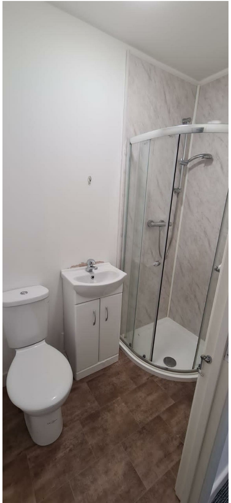
Shared Shower Room For Rooms 4 & 5