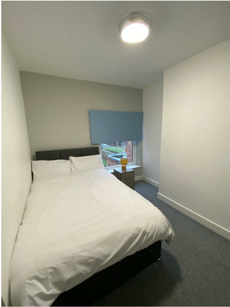
Room Four 3.76m x 3.28m (12'4 x 10'9)