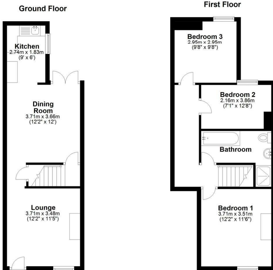
NICHOLAS HUMPHREYS. This Floorplan is for illustrative purposes only and while reasonable efforts have been made to ensure its accuracy, it is not to scale and measurements should not be relied upon. For display and layout purpose only used by NICHOLAS HUMPHREYS, as a general indication of the layout. It does not form any part of any contract or warranty. Plan produced using PlanUp.