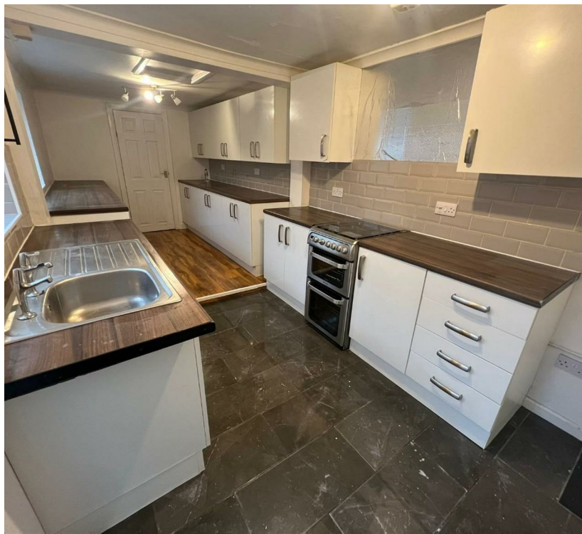
12 Henry Street PE1 2QG