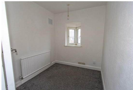
First Floor & Landing:

Dining Room: 3.09m x 2.85m (10'1" x 9'3")