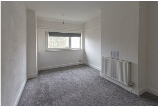
Lounge: 4.75m x 3.01m max (15'6" x 9'9")