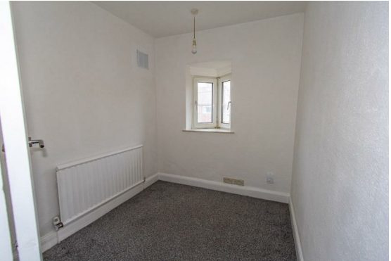
First Floor & Landing: