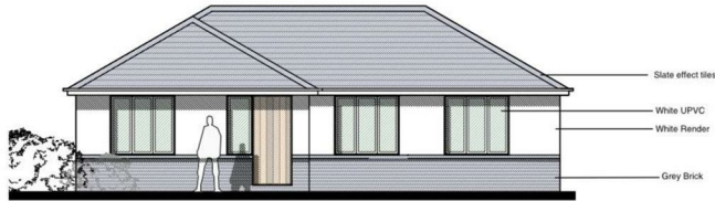
PROPOSED FRONT (SOUTH) ELEVATION SCALE 1:100@A3