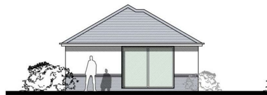
PROPOSED SIDE (WEST) ELEVATION SCALE 1:100@A3

15b Palmer Road, Poole, BH15 3AR Guide price £375,000