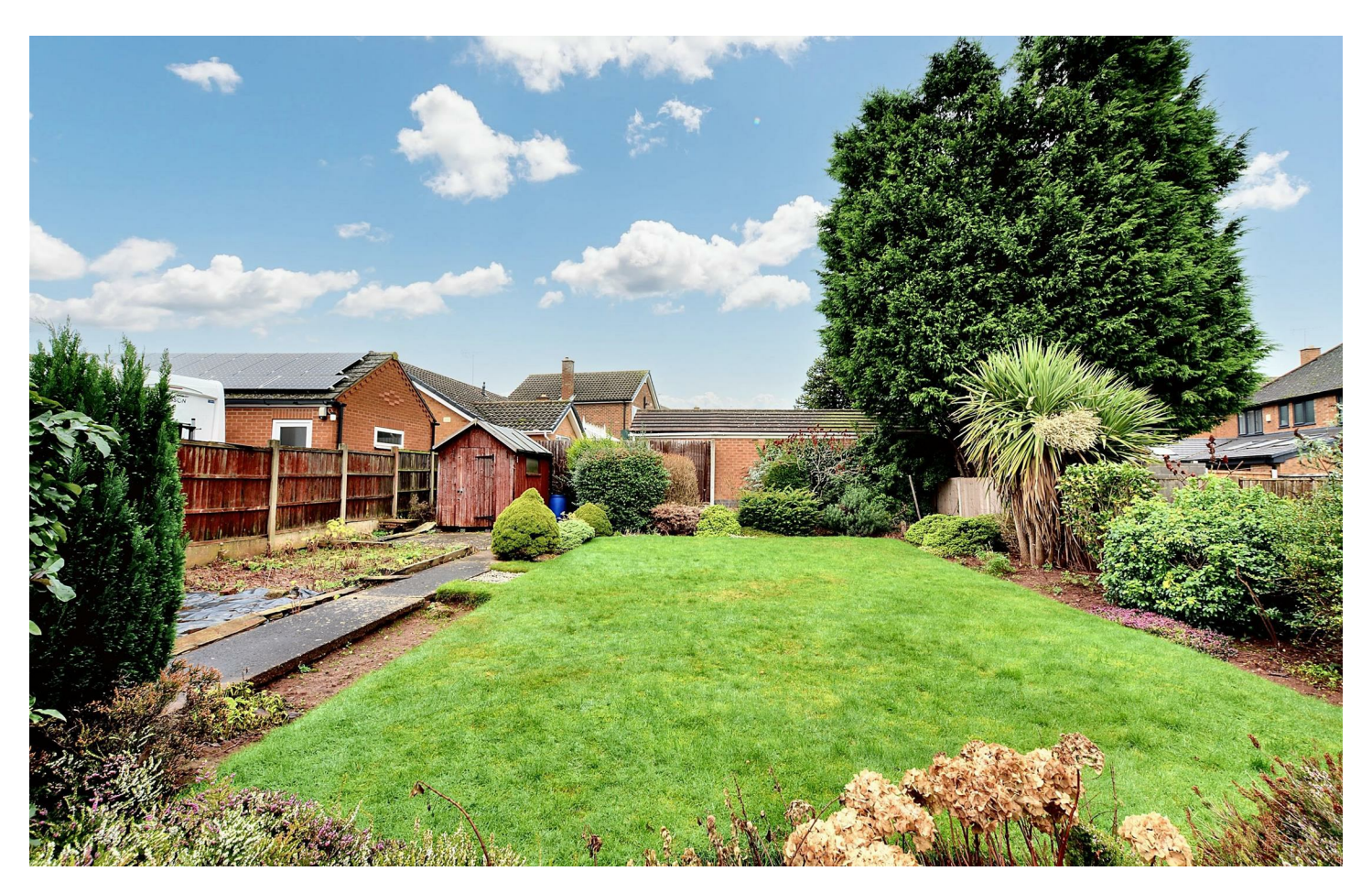
**MUST VIEW** **LARGE REAR GARDEN** **OFF STREET PARKING**

Robert Ellis Estate Agents are delighted to offer to the market this TWO DOUBLE BEDROOM DETACHED bungalow situated in Aspley, Nottingham.