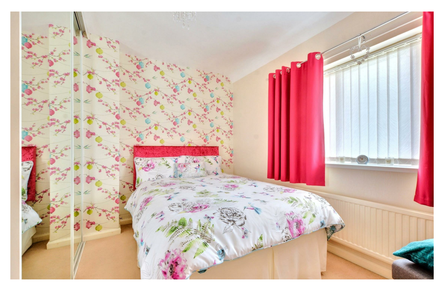
***GUIDE PRICE £180,000 - £185,000*** A THREE BEDROOM SEMI-DETACHED HOME WITH NO UPWARD CHAIN – CLOSE TO THE CITY HOSPITAL

Robert Ellis are pleased to bring to the market this well-proportioned three bedroom semi-detached property, ideally suited to first-time buyers or buy-to-let investors. Situated in a popular residential area of Basford, the property is within easy reach of Nottingham City Hospital and Nottingham City Centre, offering excellent transport links and local amenities.