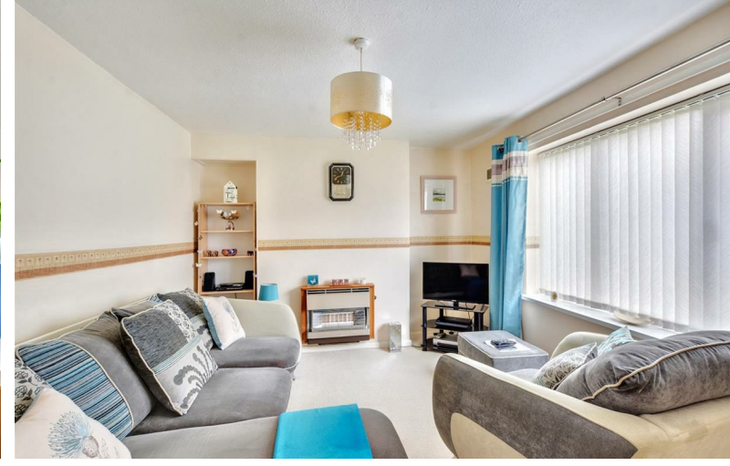
Staplehurst Drive Basford, Nottingham NG5 INY