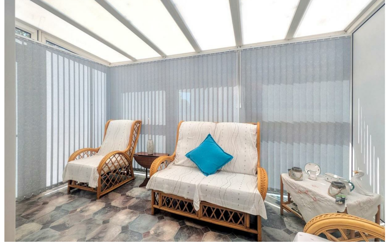
Walnut Grove Calverton, Nottingham NG14 6HT