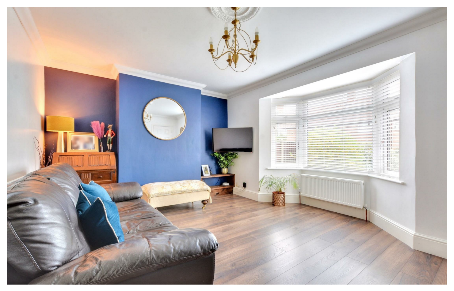
***GUIDE PRICE £200,000 - £210,000***