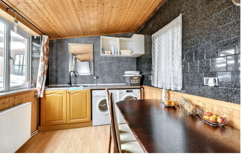
Corben Gardens Snape Wood, Nottingham NG6 7FE