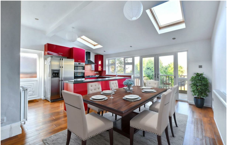
Woodthorpe Drive Woodthorpe, Nottingham NG5 4GY