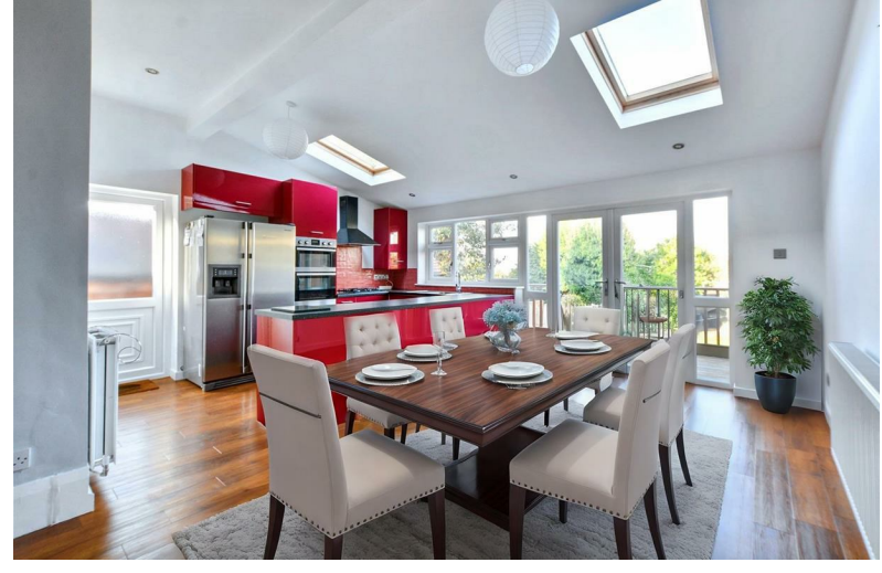
Woodthorpe Drive Woodthorpe, Nottingham NG5 4GY