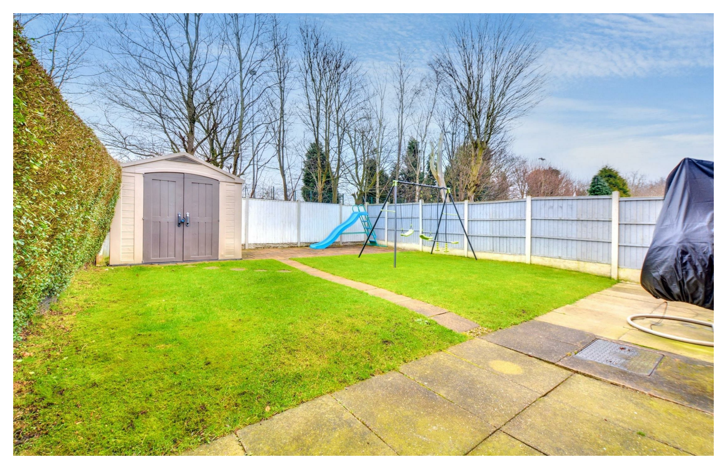
Robert Ellis Estate Agents are delighted to offer to the market this IMMACULATE THREE BEDROOM, RENOVATED SEMI DEATCHED HOME situated in the HEART of ARNOLD, NOTTINGHAM.

The property is a stone's throw away from Arnold town center accommodating local amenities, shops and restaurants. Alongside this, it offers easily accessible transport links into Mapperley, Nottingham City center and surrounding villages/towns. You have Redhill Academy and Richard Bonington Primary & Nursery schools within the area, making it ideal for families.