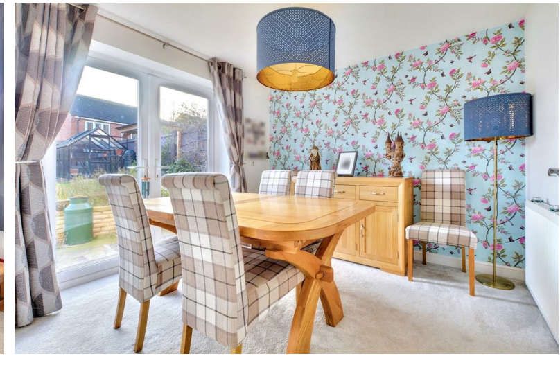
Longue Drive Calverton, Nottingham NG14 6QE