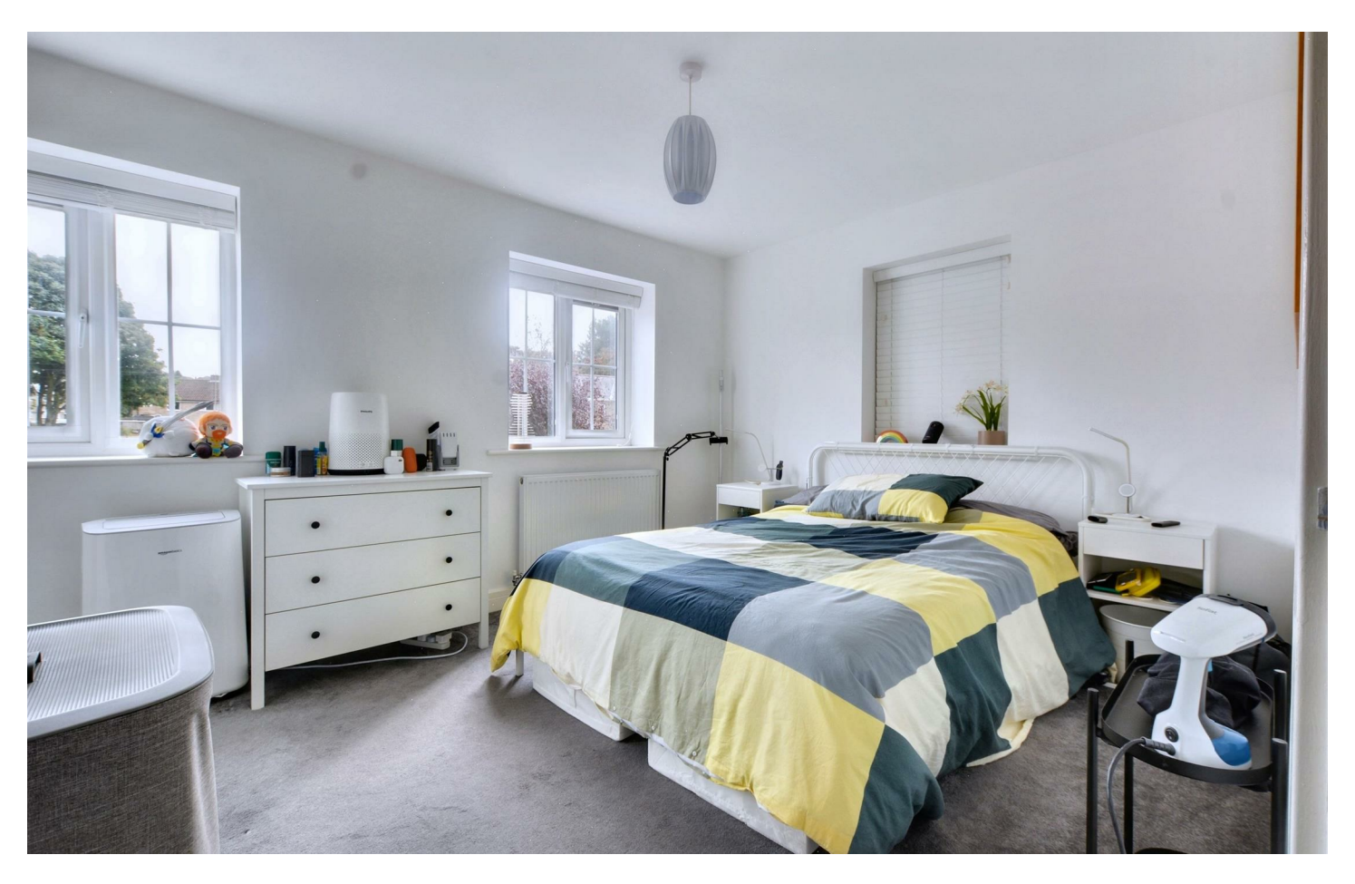
***IDEAL FIRST TIME BUY***

Robert Ellis Estate Agents are delighted to bring to the market this TWO-BEDROOM, END OF TERRACE HOME, located in the popular area of Bestwood Village, Nottingham. Ideally situated close to local schools, shops, and excellent transport links, with easy access to the MI and City Hospital, this property offers convenience and comfort.