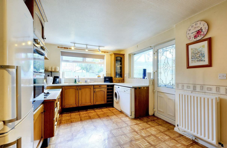
St. Albans Road Arnold, Nottingham NG5 6GT