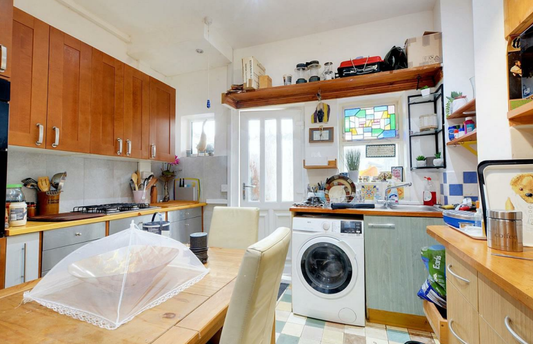
Waterloo Promenade Hyson Green, Nottingham NG7 4AT

A FIVE BEDROOM THREE STOREY EXTENDED PROPERTY WITH SECURE STORAGE.