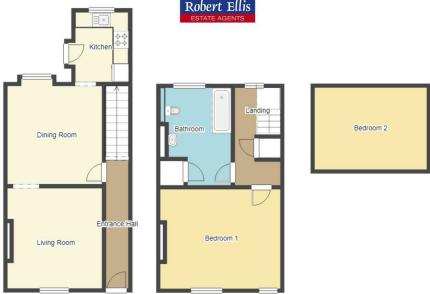
HOUSE 3 & 5