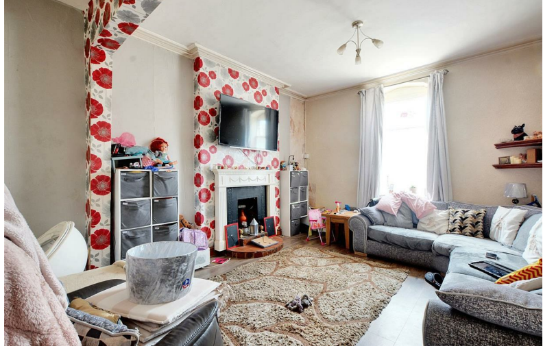
Filey Street & Car Lot Bulwell, Nottingham NG6 8EH