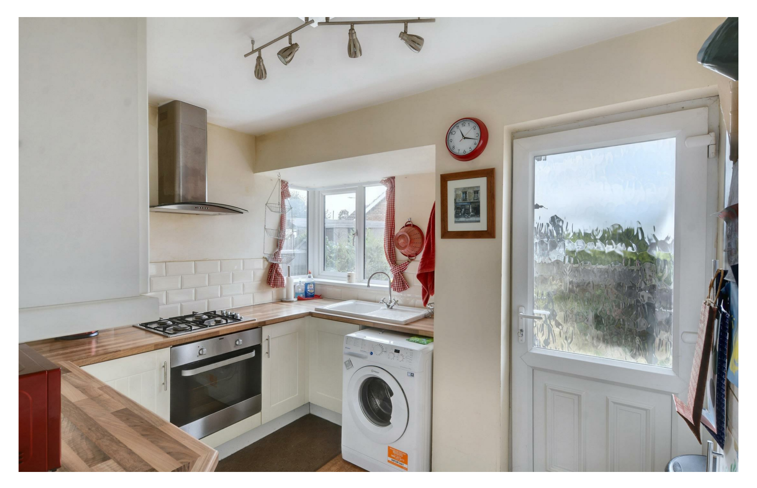
Robert Ellis Estate Agents are delighted to offer to the market this TWO BEDROOM SEMI-DETACHED BUNGALOW situated in Arnold, Nottingham.

The property is a stone's throw away from Arnold town centre accommodating local amenities, shops, and restaurants. Alongside this, it offers easily accessible transport links into Mapperley, Nottingham City centre and surrounding villages/towns. You have Redhill Academy and Richard Bonington School, Arnold Mill School Pinewood Infant School & Killisick Junior within the area, making it ideal for families.