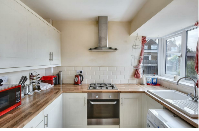
Cranston Avenue Arnold, Nottingham NG5 8DP