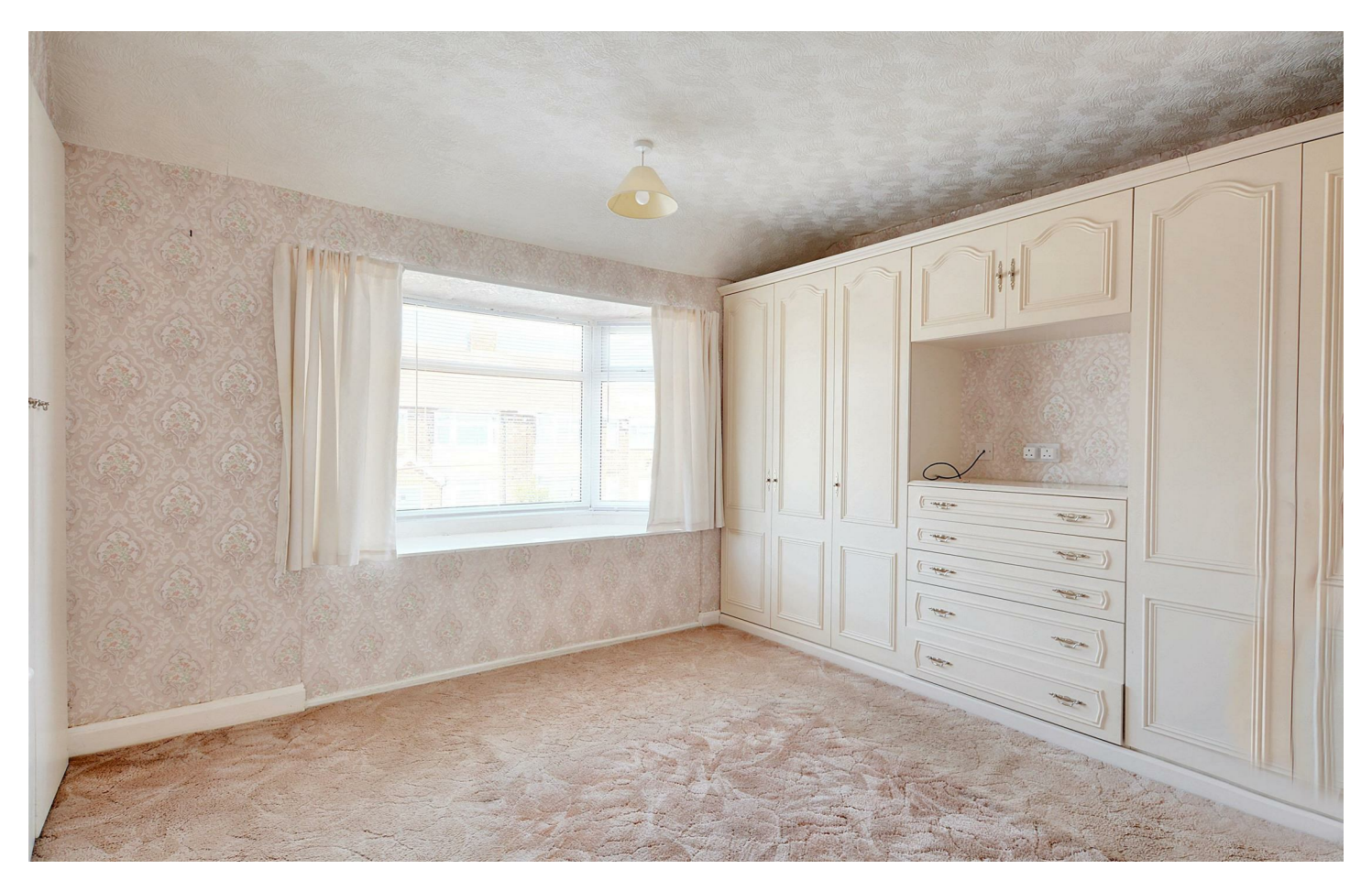
** GUIDE PRICE £190,000 - £200,000 ** *** MUST VIEW ***

Robert Ellis Estate Agents are delighted to offer to the market this TWO DOUBLE BEDROOM SEMI-DETACHED property situated in the heart of Arnold, Nottingham.