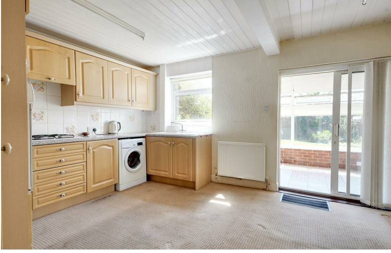
Nursery Road Arnold, Nottingham NG5 7ET