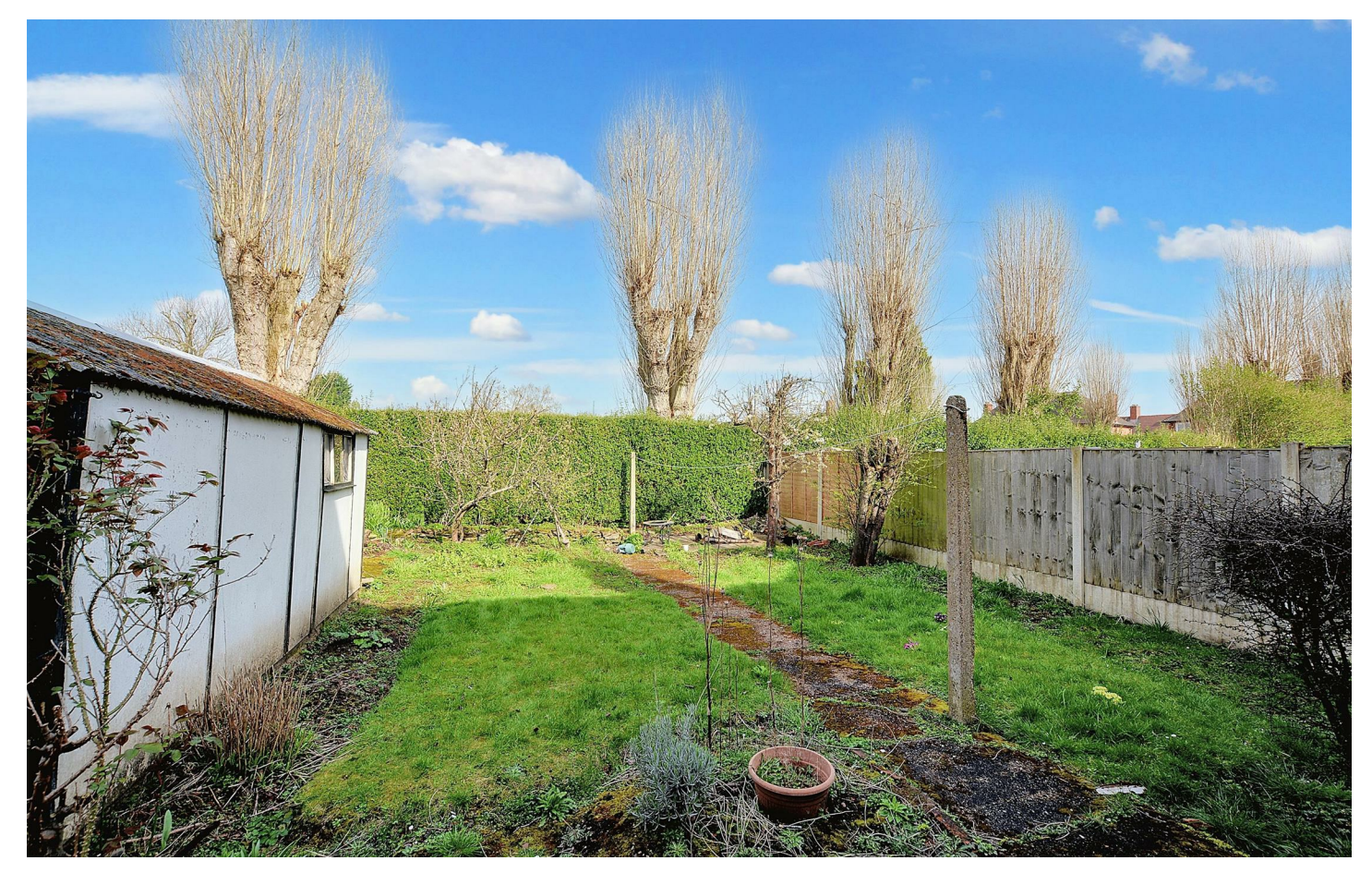
** GUIDE PRICE £210,000 - £220,000 **

Robert Ellis Estate Agents are delighted to bring to the market this FANTASTIC THREE BEDROOM, END OF TERRACE FAMILY HOME situated in SHERWOOD, NOTTINGHAM.