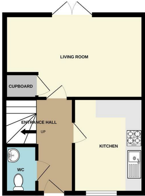
GROUND FLOOR 377 sq.ft. (35.0 sq.m.) approx.