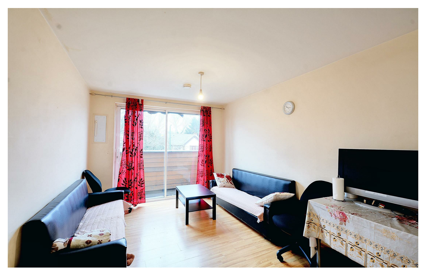
** CALLING ALL INVESTORS ** DO NOT MISS OUT **

Welcome to Teesdale Court, this two bedroom apartment which is conveniently situated close to Nottingham City Centre, this property would be perfect for an investor who wants to add to their portfolio.