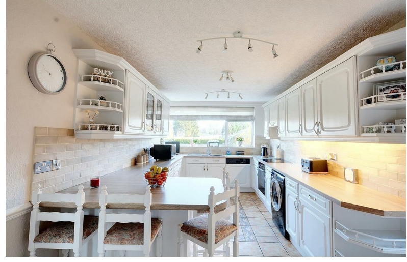
Somersby Road Woodthorpe, Nottingham NG5 4LT