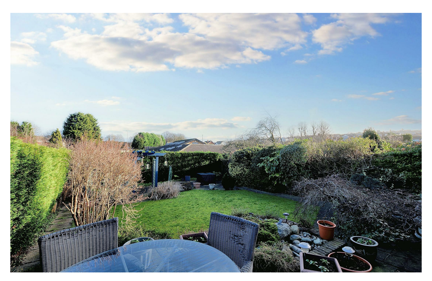
** IDEAL DETACHED FAMILY HOME ** MUST VIEW **