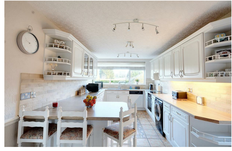
Somersby Road Woodthorpe, Nottingham NG5 4LT