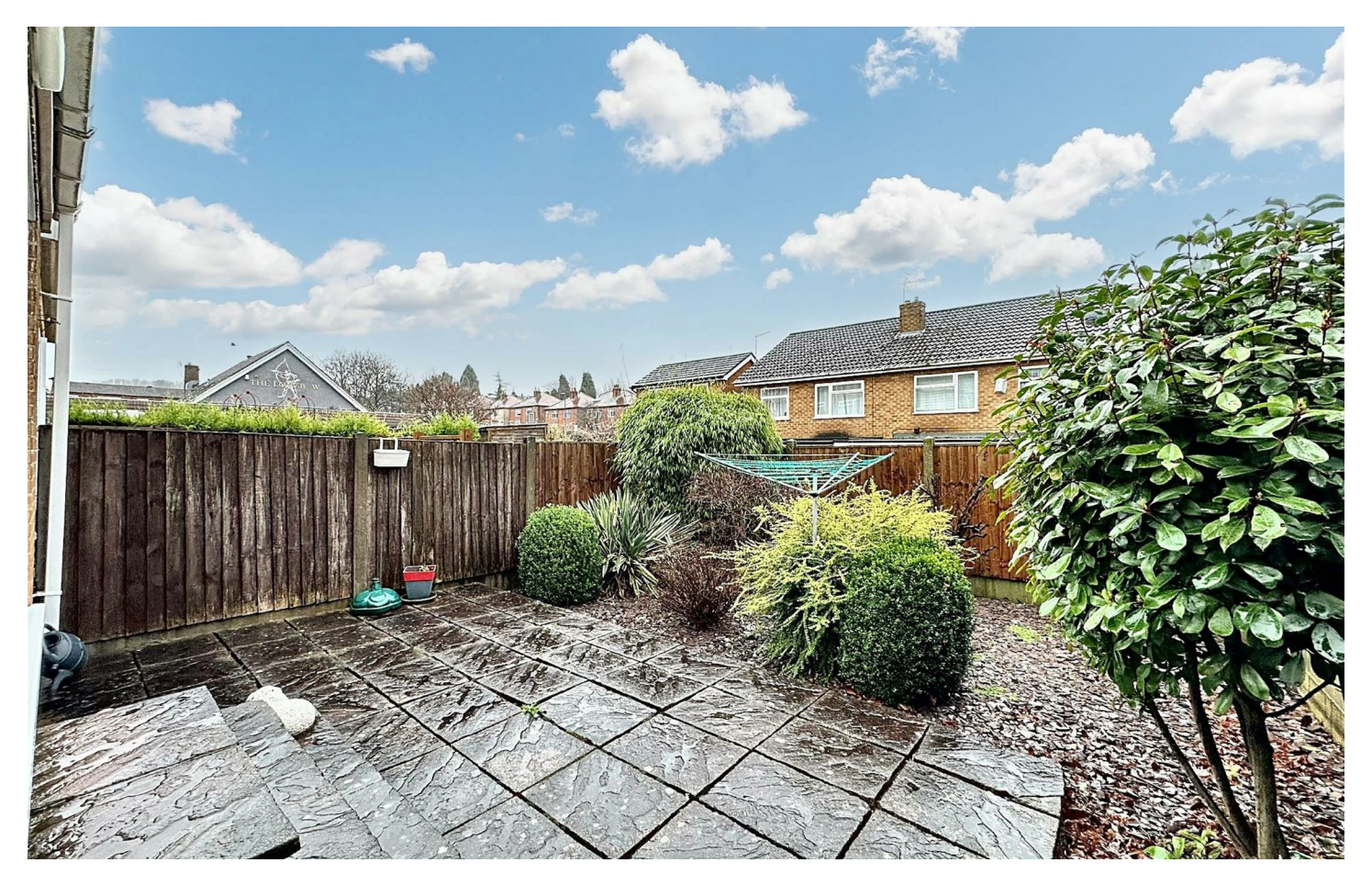
** GUIDE PRICE £255,000 - £265,000 **

Robert Ellis Estate Agents are delighted to bring to the market this FANTASTIC THREE-BEDROOM, SEMI-DETACHED HOME situated in the HEART of ARNOLD, NOTTINGHAM.